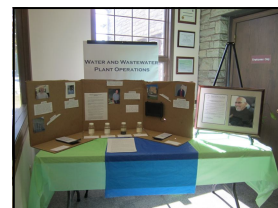
Water & Wastewater Plant Operations