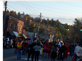
Above pictures are courtesy of Blowing Rock News